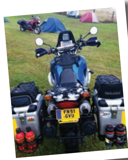
Left: Luggage and camping gear were big features of the gathering.

It was also an eye opener to walk around and look at people's bikes and equipment, particularly