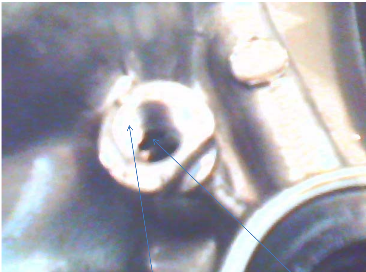
View from inside side cover showing the thread through to the crank case with an oil port through to the filter housing, this is where the oil filter cover bottom bolt secures