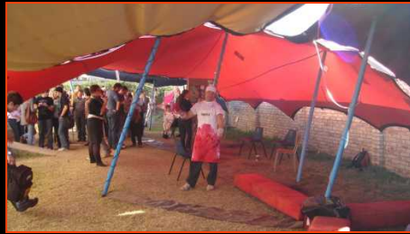
b) Grahamstown Festival x 3 Bike, Bakkie, Tantalizers