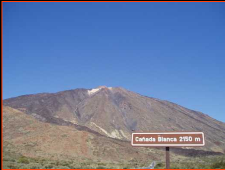
e) Canaries A real holiday