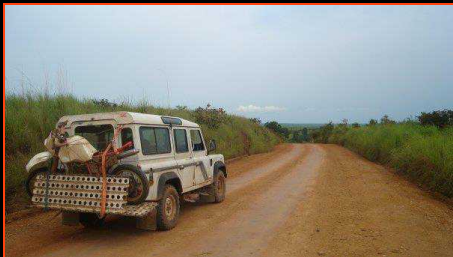
g) Short Way Down Lagos to Cape Town with Naija & DozerII