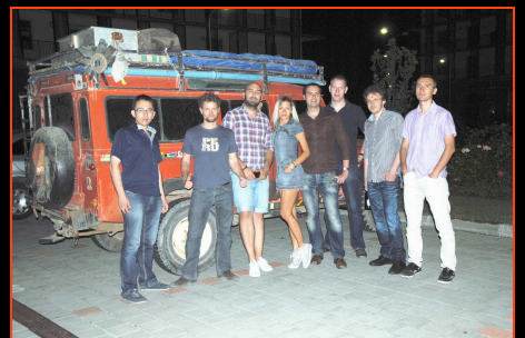
l) Aude to Asmita 13 countries around Eastern Europe