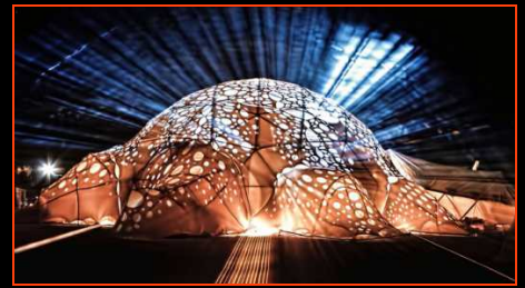
c) Afrika Burn(s) Neon Nomads, Astromini, Succulents, DPW