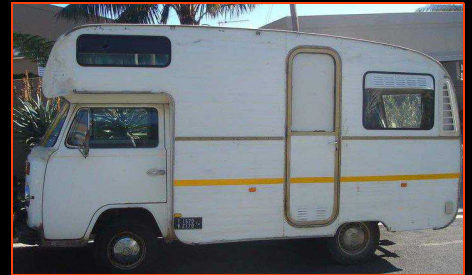
f) Autovilla and other wheeler dealing