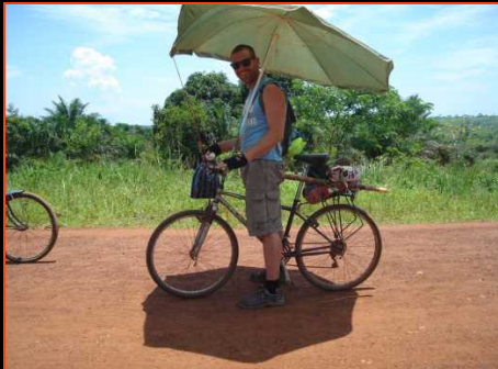
h) Road to Knowhere / Fuck Angola Cape to Cameroon including Lubumbashi to Kinshasa