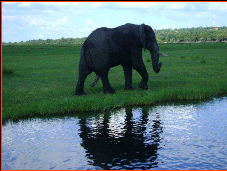
d) Kumuka African Travel Quiz Competition Winner