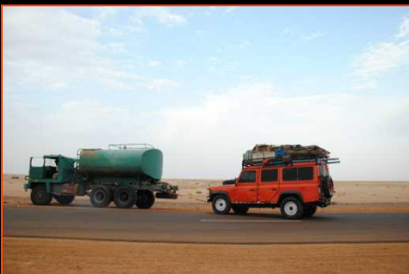
j) Western Sahara to Wa Another 10 countries trying to 'leave Africa'