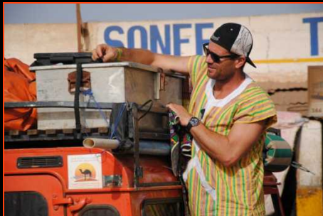
k) Erimon to Esperaza finally make it to Europe