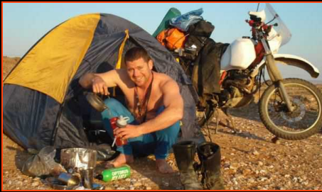
a) Short Way Up Cape Town to Lagos on a motorbike