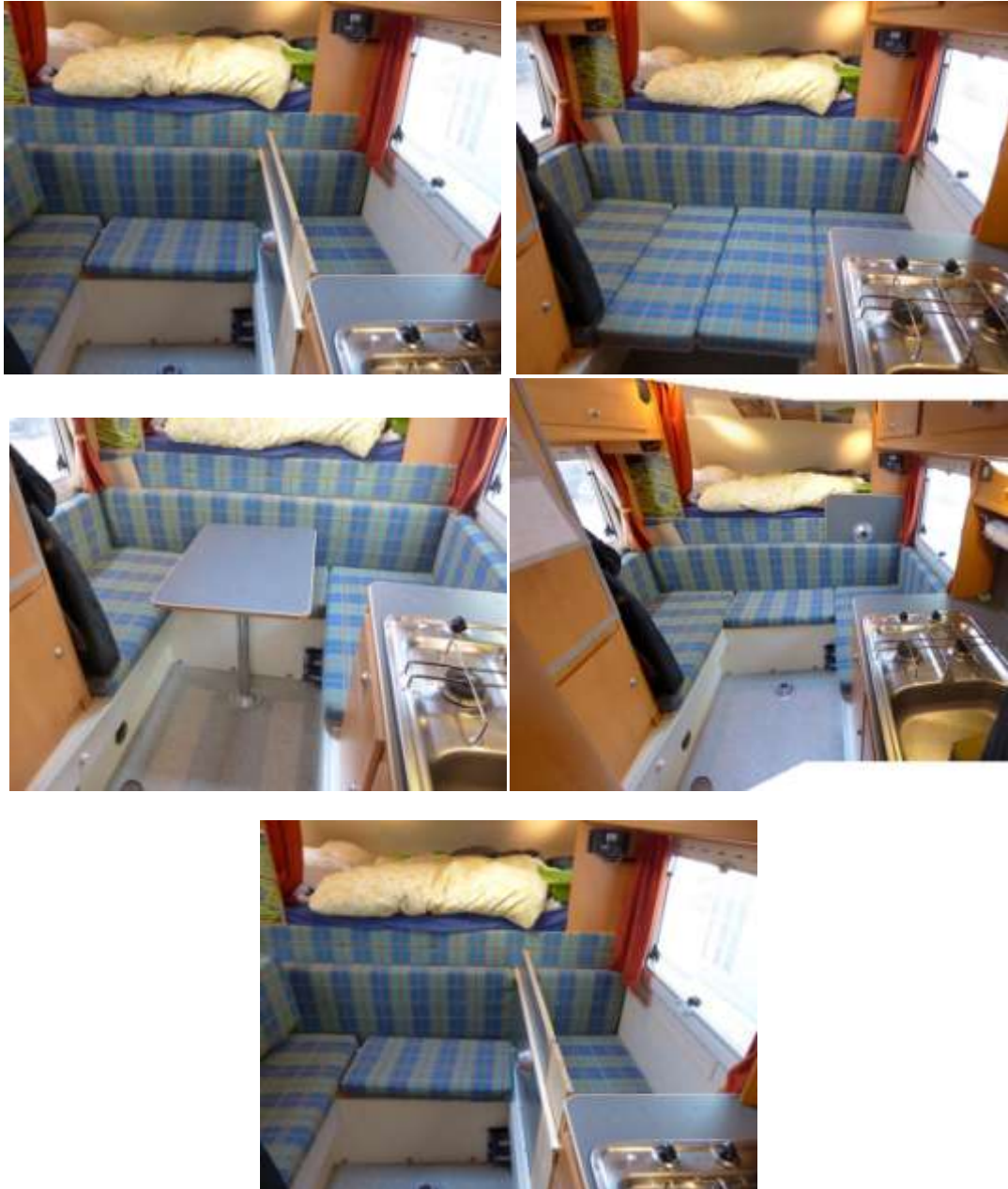
Table can be used for another sleeping area for two more people or we build for our child a special construction so he cannot fall down during the night – very useful if the child is not too big (I would say up till 2 – 2,5 years)