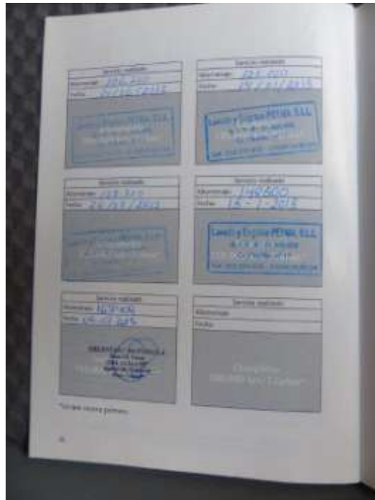
All car services done and documented