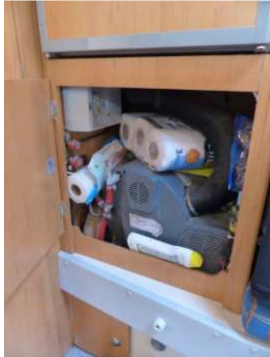
Fridge and the TRUMA heating and warm water boiler