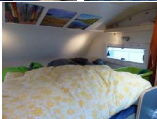
Alcoven. Much place with 2 x 1,53 m