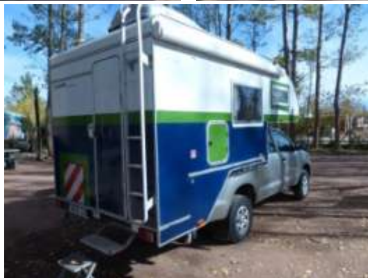
Some pictures from the outside of the camper