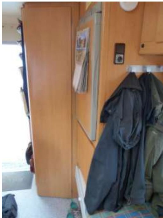
Some pictures of the inside of the cabin