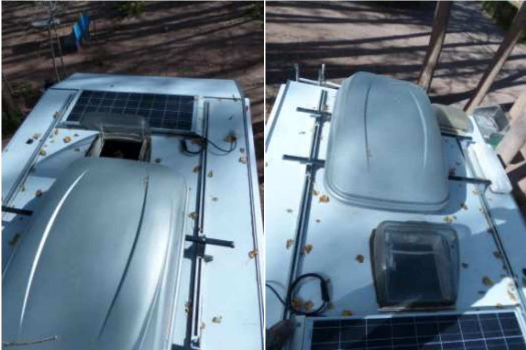
Pictures from the top with the 120 W solar panel and the roof top box